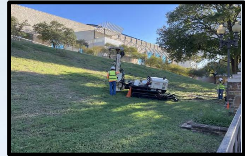
View of drilling environmental soil borings at the Hemisfair Internal Streets